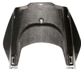
HP CARBON SILENCER COVER