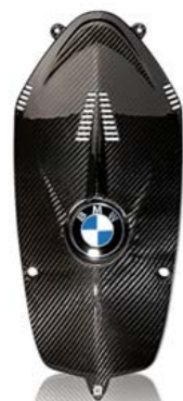
HP CARBON ENGINE COVER