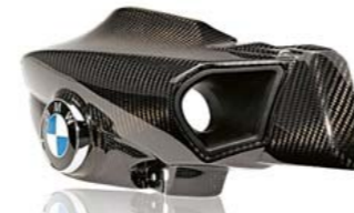
HP CARBON AIR INTAKE