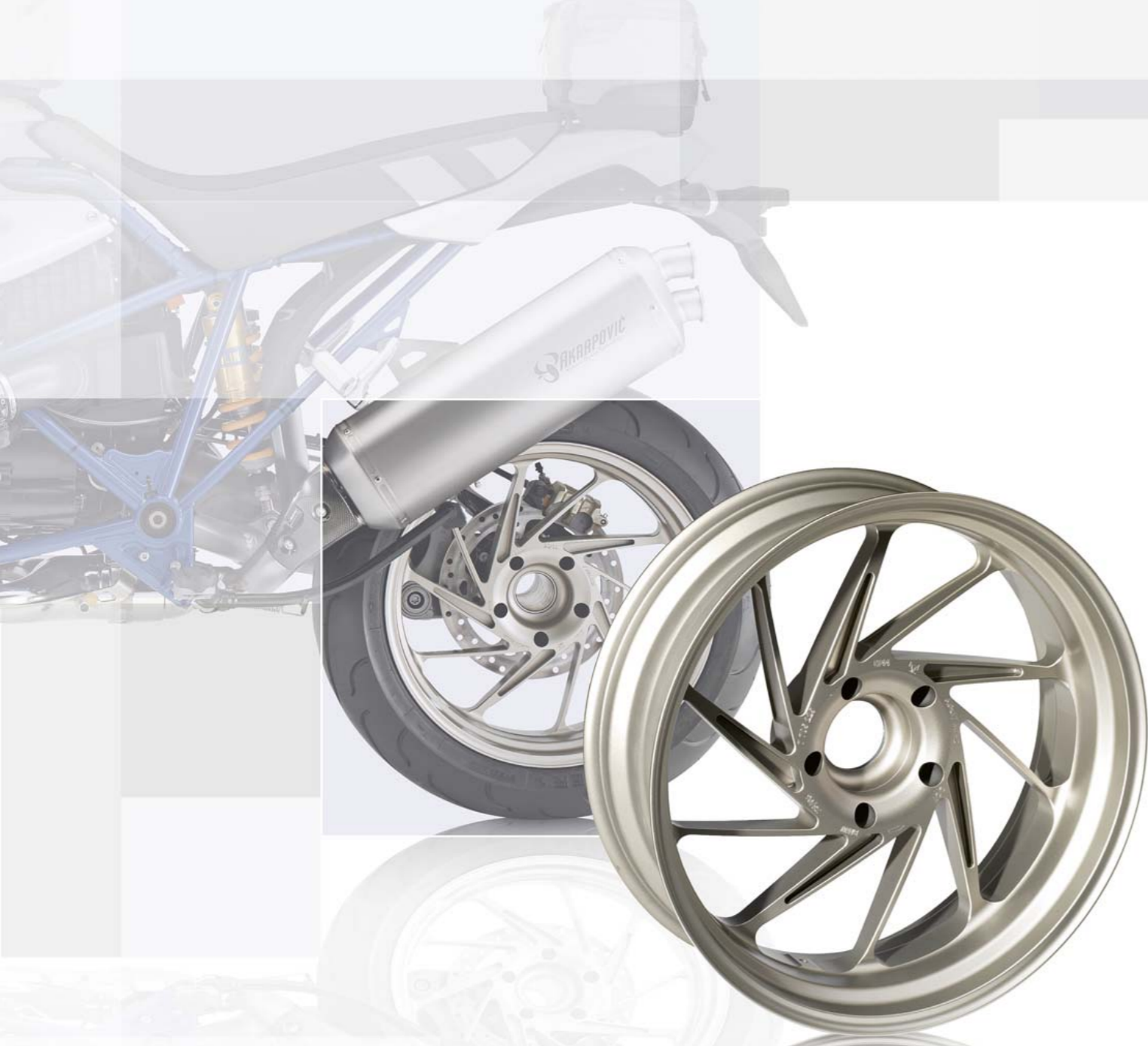
HP FORGED WHEELS