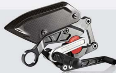
HP RIDER FOOT PEGS