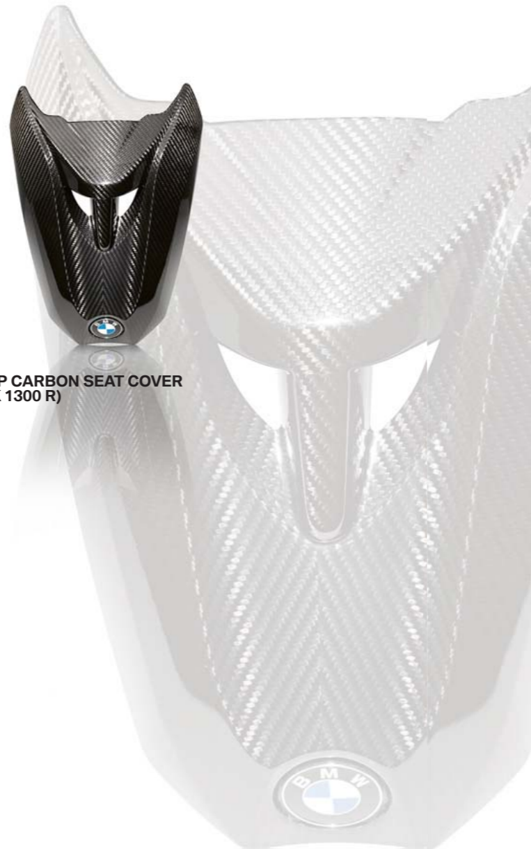
HP CARBON SEAT COVER (K 1300 R)