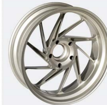
HP FORGED WHEELS