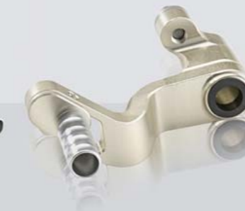
HP MILLED GEAR LEVER