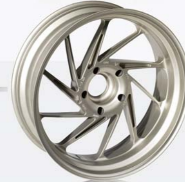
HP FORGED WHEELS