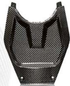
HP CARBON AIRBOX COVER