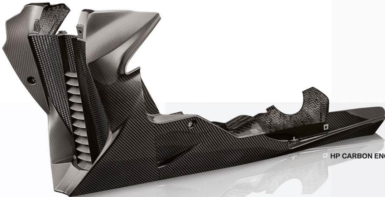
HP CARBON ENGINE SPOILER