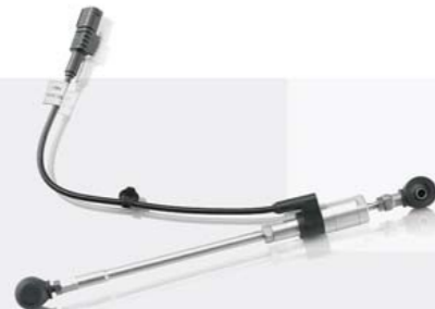
HP GEAR-SHIFT ASSIST WITH INVERTED SHIFT DIRECTION