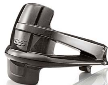
HP CARBON REAR SPLASH PROTECTOR