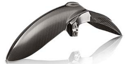
HP CARBON FRONT MUDGUARD