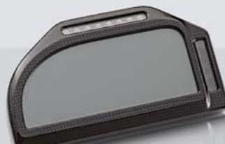
HP INSTRUMENT CLUSTER