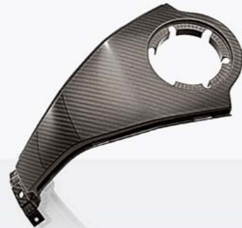
HP CARBON TANK COVER