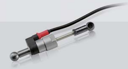
HP GEAR-SHIFT ASSIST WITH INVERTED SHIFT DIRECTION