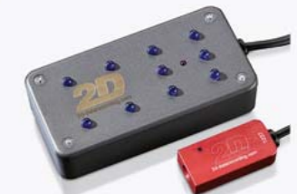
HP LAP TIMER