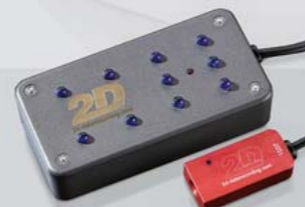
HP LAP TIMER