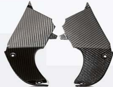
HP CARBON COCKPIT INTERIOR PANELS