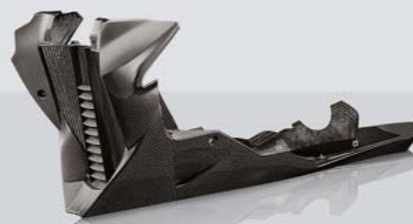
HP CARBON ENGINE SPOILER