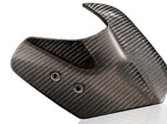
HP CARBON WINDSHIELD