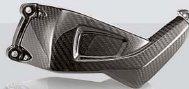
HP CARBON CLUTCH COVER TRIM