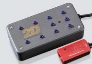
HP LAP TIMER