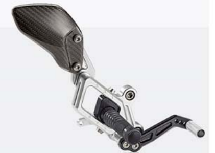
HP RIDER FOOT PEGS