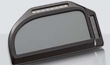
HP INSTRUMENT CLUSTER