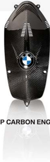
HP CARBON ENGINE COVER