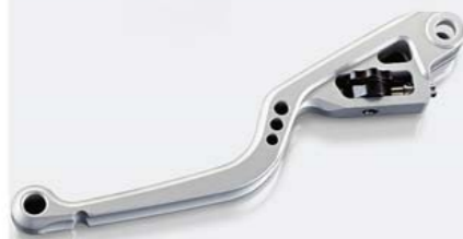
HP MILLED HAND LEVER