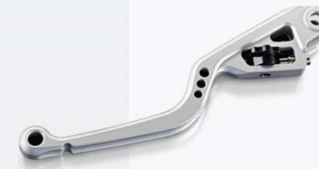
HP MILLED HAND LEVER