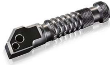
HP PILLION PASSENGER FOOT PEGS