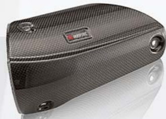
HP CARBON HEAT PROTECTOR FOR STANDARD SILENCER