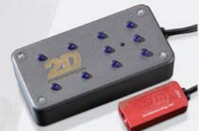
HP LAP TIMER