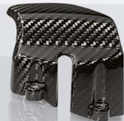
HP CARBON CLUTCH TRIM