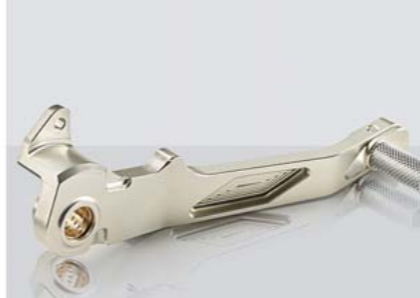
HP MILLED FOOTBRAKE LEVER