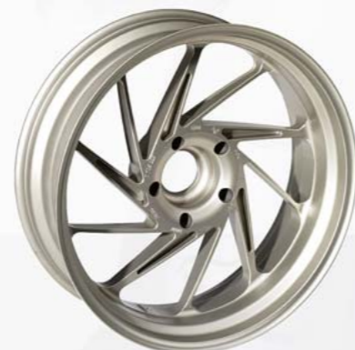
HP FORGED WHEELS