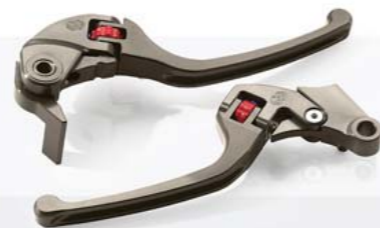
HP CLUTCH LEVER HP BRAKE LEVER