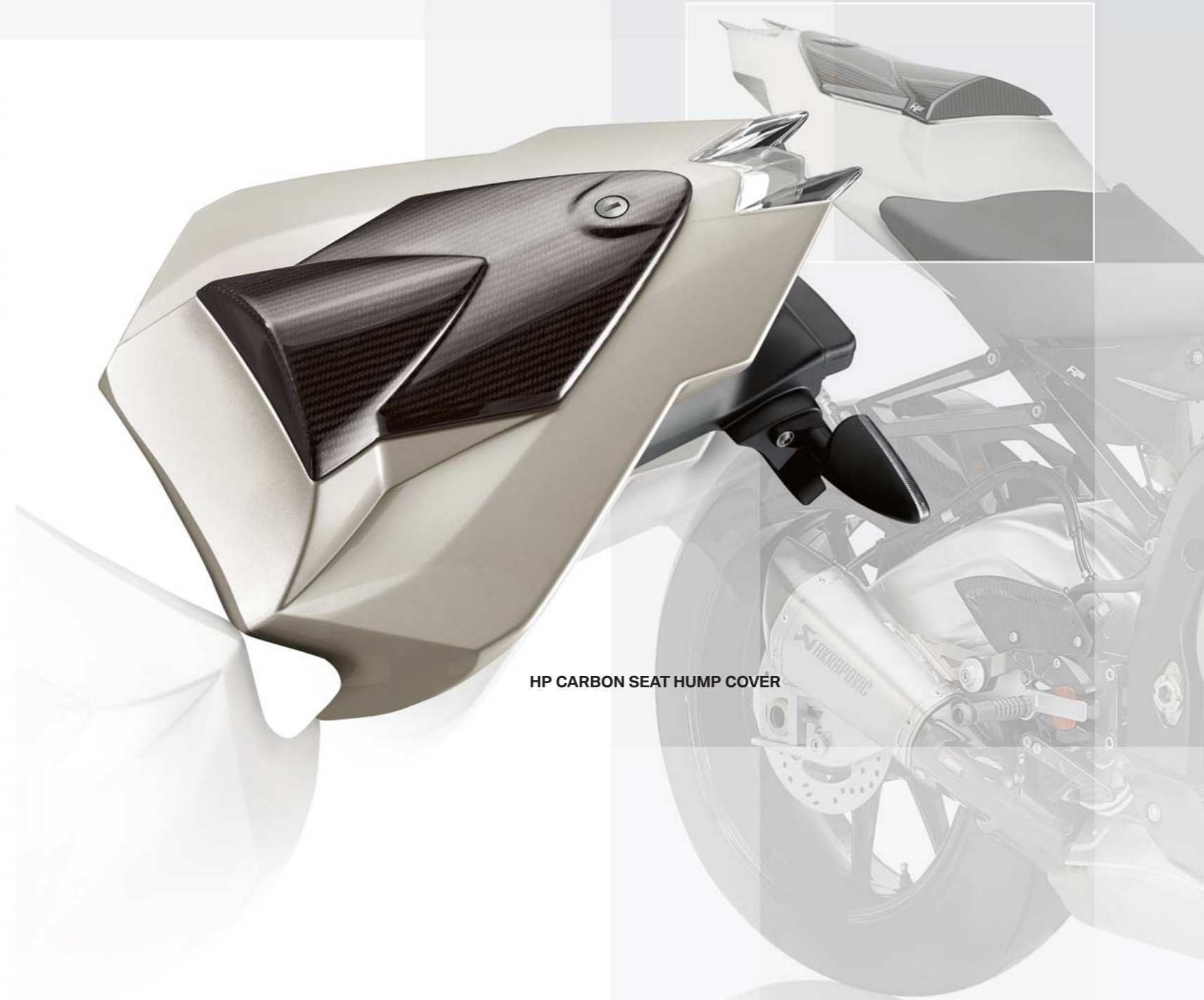
HP CARBON SEAT HUMP COVER

formance is everything. So they're perfect for this motorcycle. And the same goes for the lap timer, aluminium clutch and brake levers, foot pegs and gear-shift assist. Helping to keep the S 1000 RR even further ahead of the pack.