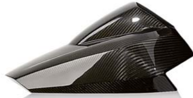
HP CARBON SEAT COVER (K 1300 S)