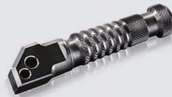
HP PILLION PASSENGER FOOT PEGS