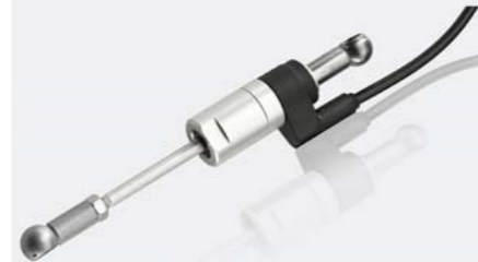
HP GEAR-SHIFT ASSIST