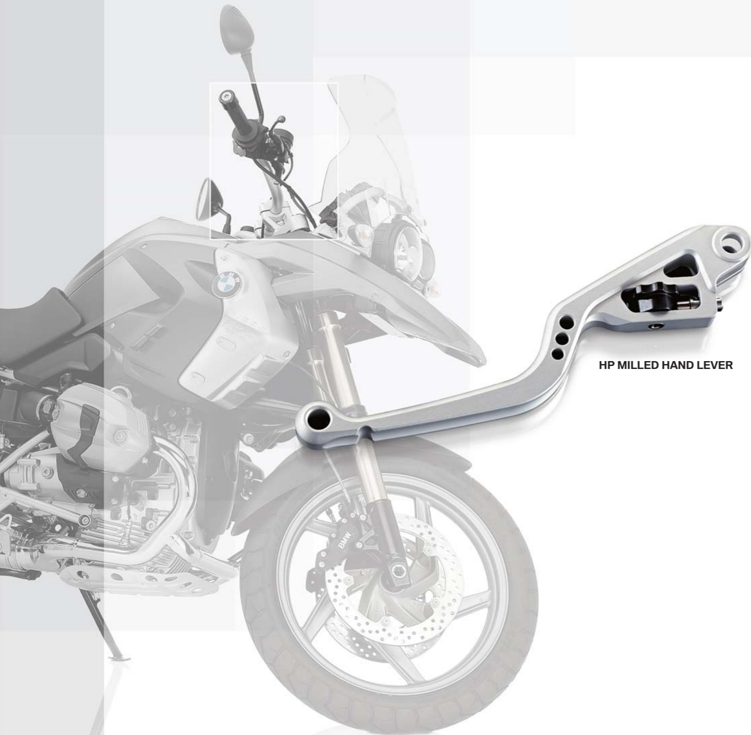
HP MILLED HAND LEVER