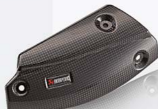
HP CARBON HEAT PROTECTOR