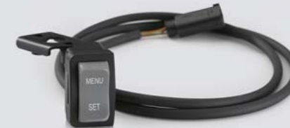
ADDITIONAL CONTROLS FOR HP INSTRUMENT CLUSTER