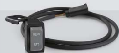
ADDITIONAL CONTROLS FOR HP INSTRUMENT CLUSTER