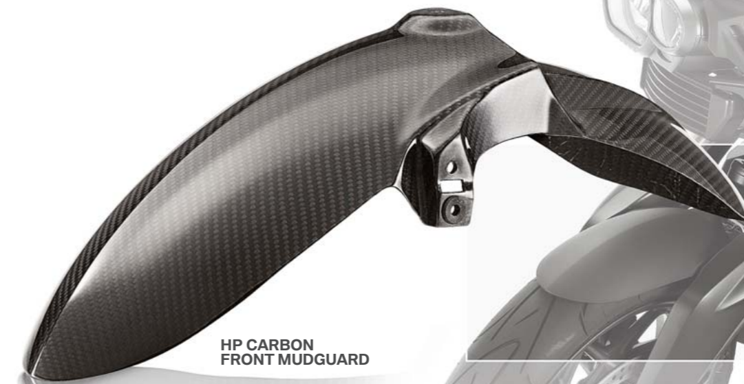
HP CARBON FRONT MUDGUARD

It doesn't get any better than this: a carbon engine spoiler, carbon covers for the seat and airbox, forged wheels and aluminium footpegs. The K-Series with High Performance components – a thrill that takes the breath away.